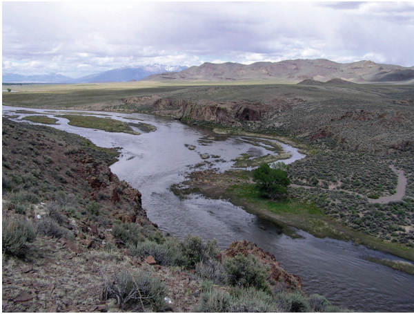
The Rio Grande, looking north at the Sangre de Cristo mountains, from near the Colorado- New Mexico border.