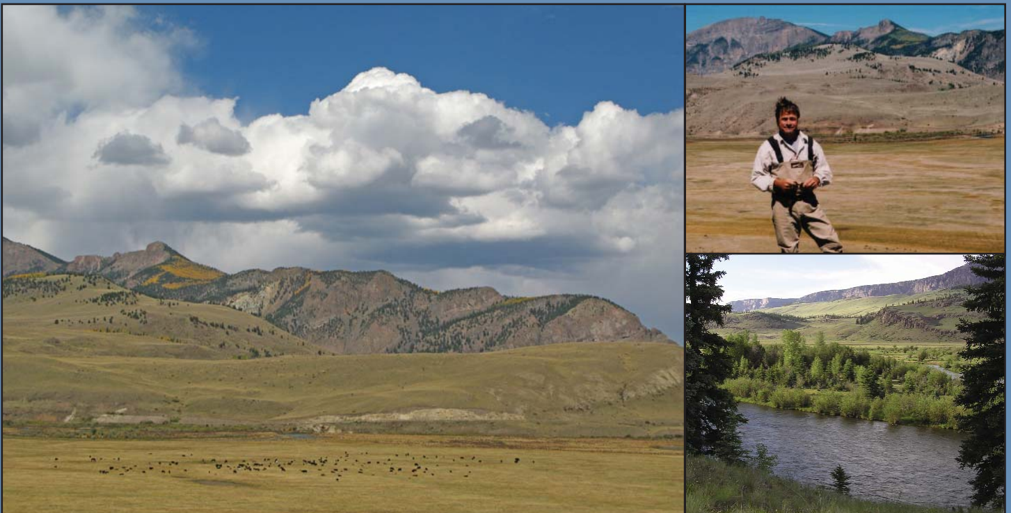
Clockwise from the top: Landowner, Alan Lisenby: View of the Rio Grande: Rio Oxbow Ranch Landscape by John Fielder

Stretching along the Silver Thread Scenic Byway, Highway 149, above Creede in Mineral County, RiGHT recently conserved 505 acres of the historic Rio Oxbow Ranch. This is Phase I of a two phase project that will protect an additional 570 acres in 2009. Overall, the ranch encompasses six miles of the Upper Rio Grande and has an extensive boundary with the Rio Grande National Forest. The owners and managers of this ranch have been recognized for their excellent management of the riparian area, which supports abundant populations of elk, deer, moose, beaver, many other small mammals, waterfowl, and migrating birds.