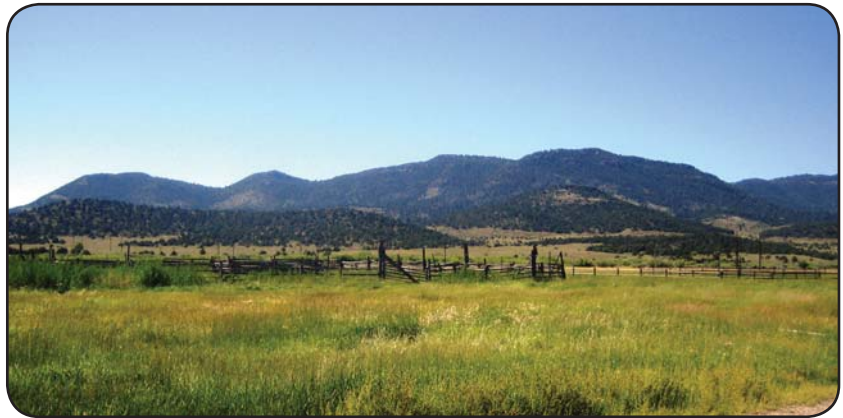
Bonanza Ranch - Protected by RiGHT in 2001

The same groups that used to mentor us now turn to us in partnership. Our work is being recognized state-wide and nationally. Recently Governor Ritter stated about our efforts to protect the Rio Grande corridor, "All Coloradans should be heartened to know that in these difficult economic times, creative people came together to protect the land, water and wildlife that are the heart and soul of one of our iconic landscapes."