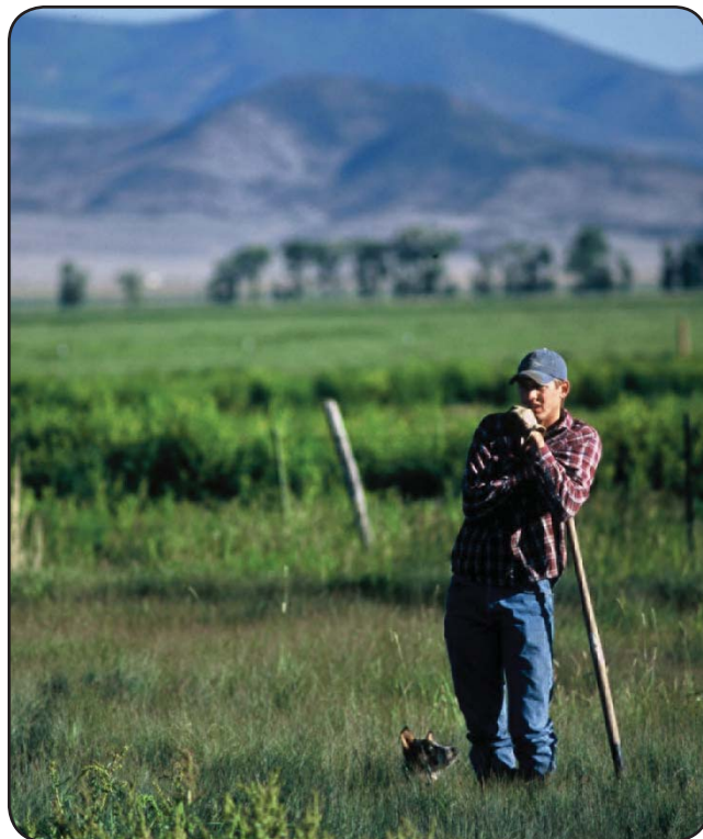
Dunn Ranch, Saguache County

The process of applying for accreditation involves a significant review of our organization and our project work. Just going through this process will identify areas for improvement, making RiGHT a much stronger organization in the end.