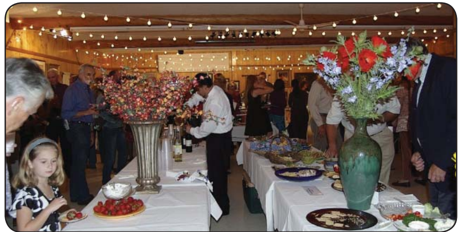
2008 Keep the Rio Grande Grand Art Event at the South Fork Community Center